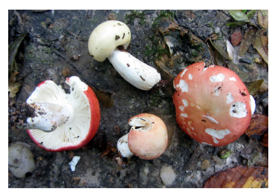
Russula rosea found today, showing its colour variation.

This is a site which often abounds with the genus Russula , the Brittlegills, and though not fruiting in quantities today we were able to take a look at several interesting species. Conspicuous by its absence today in a wood dominated by Beech was R. nobilis (Beechwood sickener, in some books R. mairei ). We