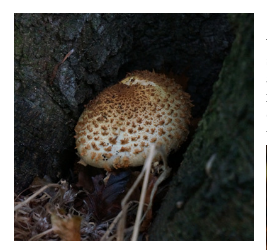
Above Pholiota squarrosa (photo PCI) Right Armillaria mellea (photo NS) Below Hypholoma fasciculare (photo NS)

Early on when the light was still very poor we came across the attractive and very scaly Pholiota squarrosa (Shaggy scalycap), just a singleton specimen at the base of a large Beech, also nearby some young specimens of Armillaria mellea (Honey fungus) and a large and fresh clump of Hypholoma fasciculare (Sulphurtuft) – all common species with which it was useful for new members to be able to acquaint themselves.