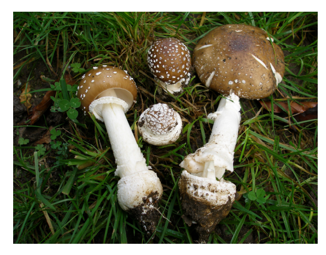
Left, Amanita excelsa var. spissa with grey veil remnants on the cap, found today, and to compare with it right A. pantherina with white veil remnants, also a more pronounced volva at the stem base.