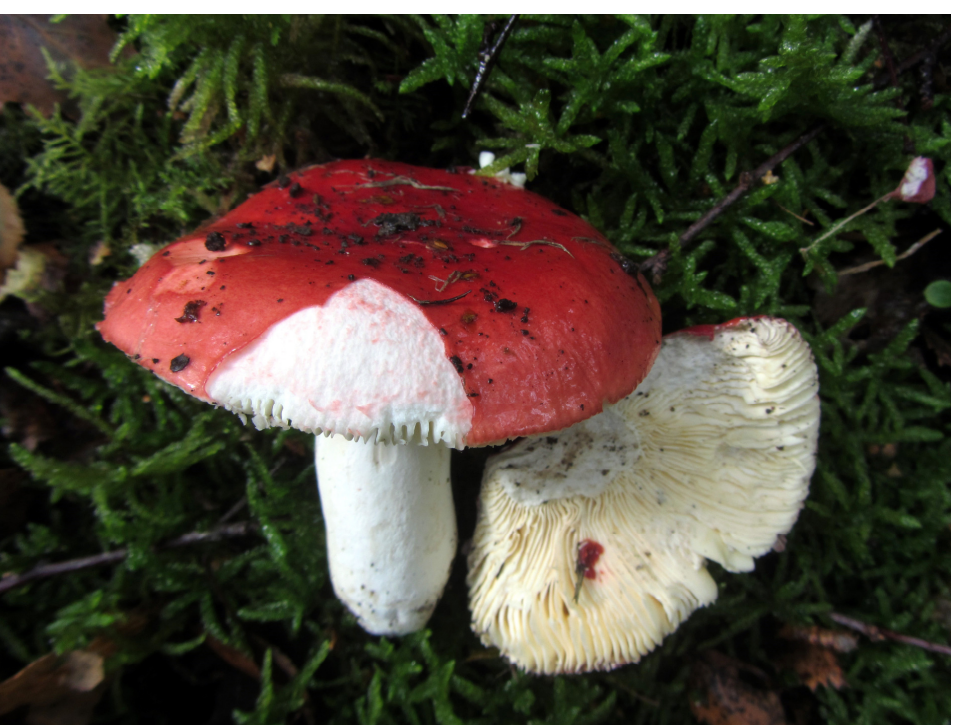
Russula pseudointegra growing under Oak today

Last week at Stoke Common we discussed another pair of similar Brittlegills, this time with yellow caps, these being the very common Russula ochroleuca (Ochre brittlegill) and the much rarer R. claroflava (Yellow swamp brittlegill). We found both again today, though only one specimen of the latter. I asked Claudi to set up the photo below of both species together in order to make a comparison between them. Firstly note the dirtier ochre yellow of R. ochroleuca on the left, compared to the bright yellow of R. claroflava on the right. Then look carefully at the stems: white in R. ochroleuca but already developing signs of reddening then blackening in R. claroflava on the right. This character is the best way to split the two species if you are in doubt, and if not visible as it already was in this specimen, it can be induced by scratching the stem with your nail and waiting say 15 to 30 minutes for the tell-tale colour change to take place. If you have R. ochroleuca it will remain white where damaged with no staining developing. It is also worth noting that the gills are white in R. ochroleuca but cream in R. claroflava ,